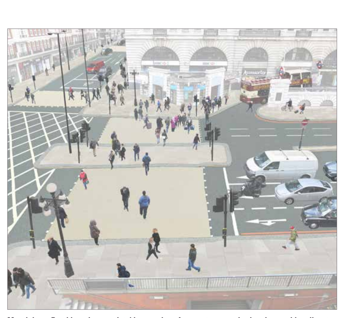
Marylebone Road junction – artists' impression of current proposals showing a wider, direct pedestrian crossing. All proposals will be subject to further detailed design development.