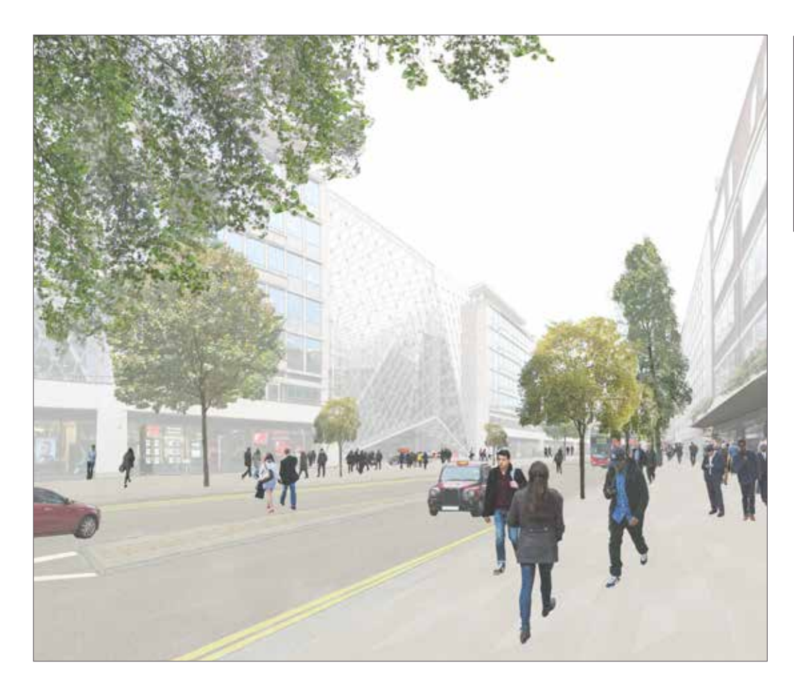
Mid Baker Street looking north – artists' impression of current proposals showing two way traffic, wider footways and opportunities for more greenery. All proposals will be subject to further detailed design development.